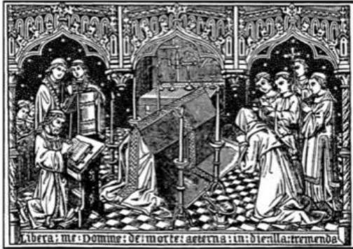
SETTING OF THE ORDINARY OF THE MASS Requiem Mass in d minor, opus 48 Gabriel Urbain Fauré (1845–1924)

Join us to remember – in music and prayer – friends and loved ones gone before us